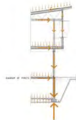
DIAGRAM OF FORCES