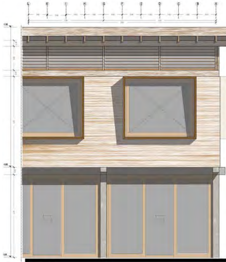
FACADE SCALE 1:20