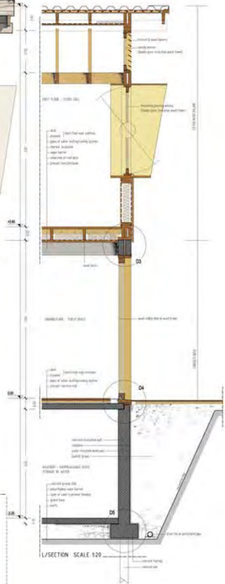
L/SECTION SCALE 1:20